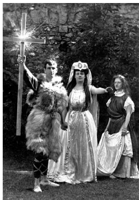
Portchester Pageant, 1932 - 'The Return of Arviragus'

Omnibuses for the convenience of the Public, from the Railway Station to the Castle, at 2d each Passenger.