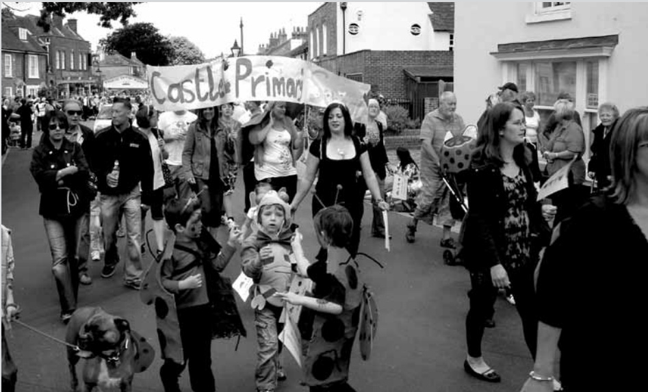
Gala Parade - 2013

The original pageant of 1907 was staged within Portchester castle to celebrate the official birthday of King Edward VII. The historical spectacular depicted the story of Portchester in six episodes and it is reported the whole village dressed up and played a part in this Oberammergau reproduction. Hundreds of visitors arriving at Portchester station were astounded to see Romans riding on bicycles and Druids driving motorcars around the village.