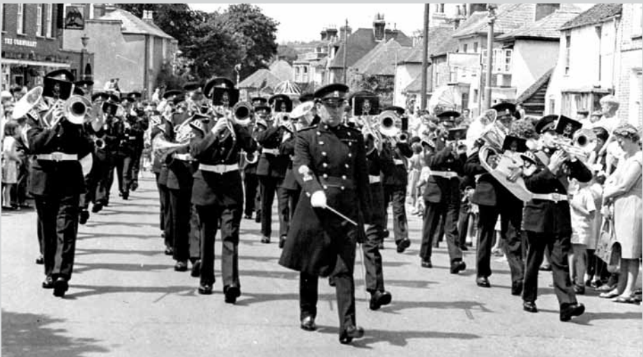
Gala past - Band march down Castle Street

Since 1999 the gala has annually continued to provide entertainment and a meeting place for the people of Portchester whilst supporting local causes. The villagers of 1907 Portchester would be pleased to know that the tradition stills exists and is flourishing.