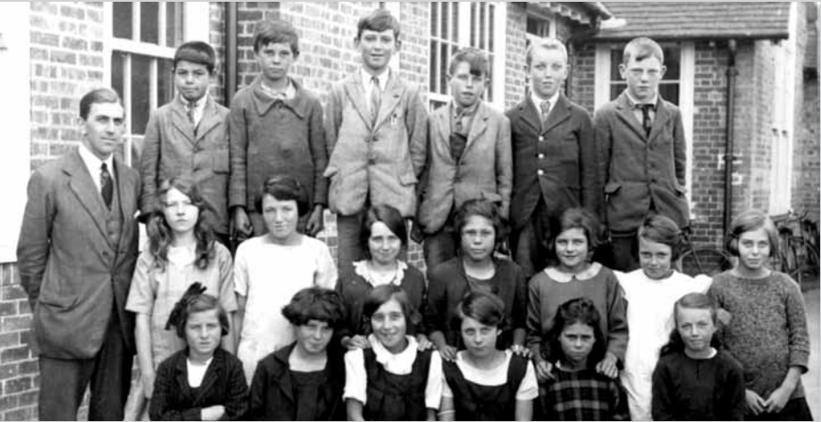
Castle Street Council School, Class 6, 1926

Jan 27th: Two parents called with letters from Superintendent of Attendance Officers - with reference to the absence through sickness of their children.