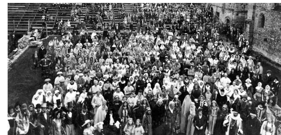
Portchester Pageant, 1932 - 'The Return of Arviragus'

the past season they have succeeded in avoiding the many crudities and imperfections incidental to the first attempt of such a character, and the result of a liberal though wise employment of capital, experience and skill, is the production of a work of art of a character and magnitude never attempted before in the provinces.