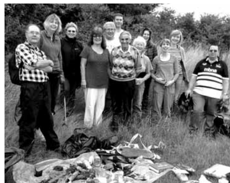
A happy band of volunteers

All in all it was a very good event with volunteers from all over the area helping to find what litter there is on the shore and keep the area clean. Thank you to those who turned up.